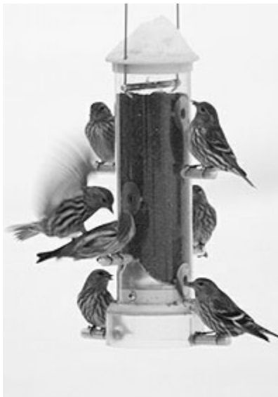
There was a massive southern movement of Pine Siskins during the 2008-09 season.